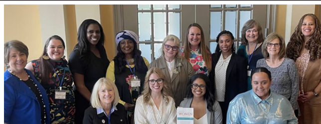
As part of the Edie Hand Foundation Educational Program, the first Women of True Grit Conference was held at Miles College on April 21, 2023. View more information. Explore the photo gallery from this event.

Do you know a Woman of True Grit? Nominate them on our Website.