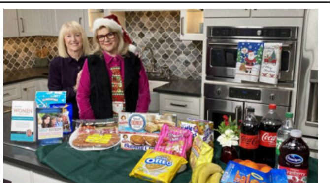
Thank you to our Women of True Grit Sponsors, Coca-Cola United and Piggly Wiggly